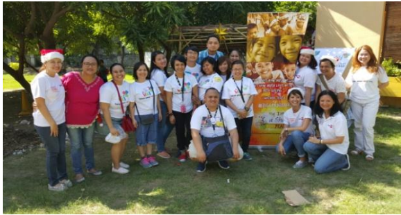
People involve in My Dream in a Shoe Box