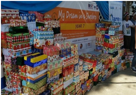
Items in a Shoe Box