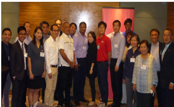
Leaders from Dow Chemicals of Singapore Shanghai, Korea, US and from PYXERA Global With Dow Chemical Philippine group